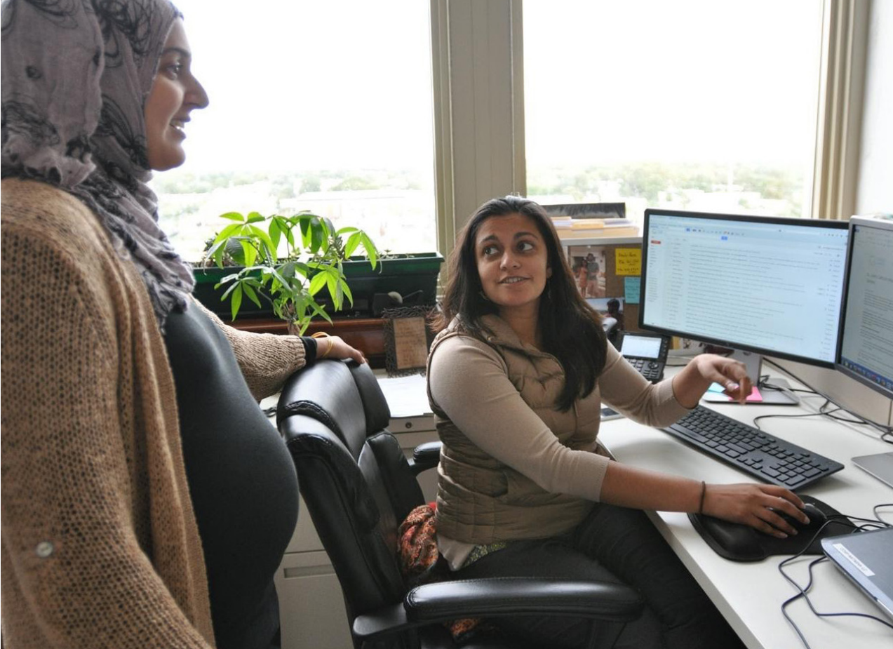
Camden Coalition staff members identify patients from across health systems who qualify for our care management programs.