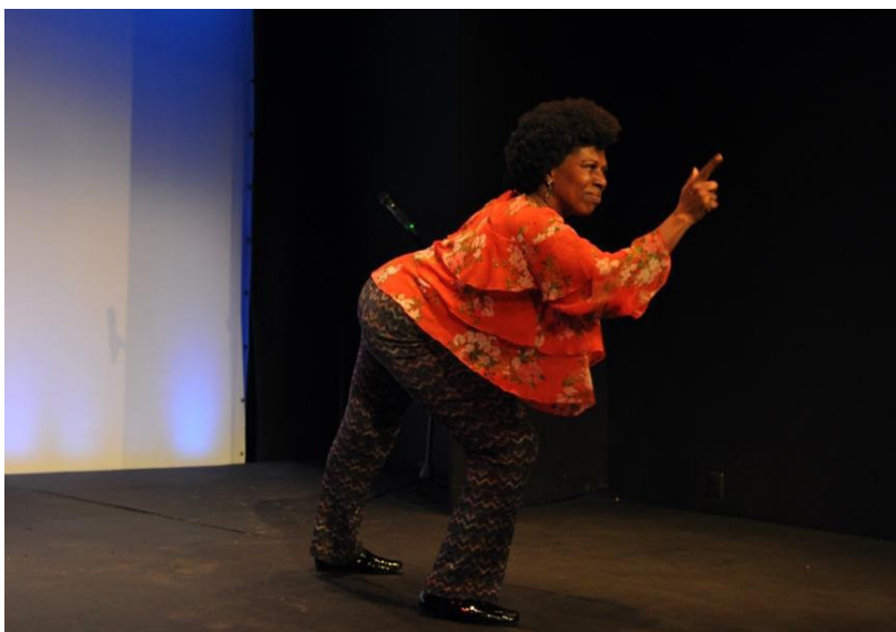
A CAC member performs her story during our "Take back our health: Stories of healing" event at Camden's Waterfront South Theater.

In June, after intensive work with local storytelling experts, CAC members performed their stories of healing at Camden's Waterfront South Theater. The CAC also launched a collaboration with local clinical and social service providers to address food insecurity in Camden. Three CAC members were selected as 2019-2020 National Consumer Scholars, serving as liaisons between our organization's local and national work.