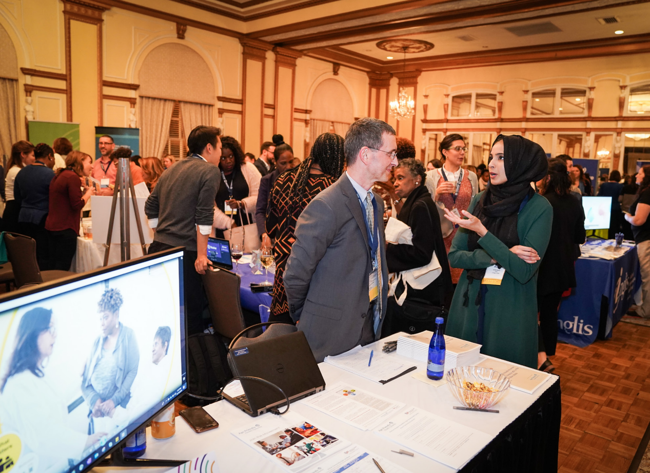
Putting Care at the Center 2019 attendees share complex care resources, findings, and strategies in the event's interactive Beehive space.