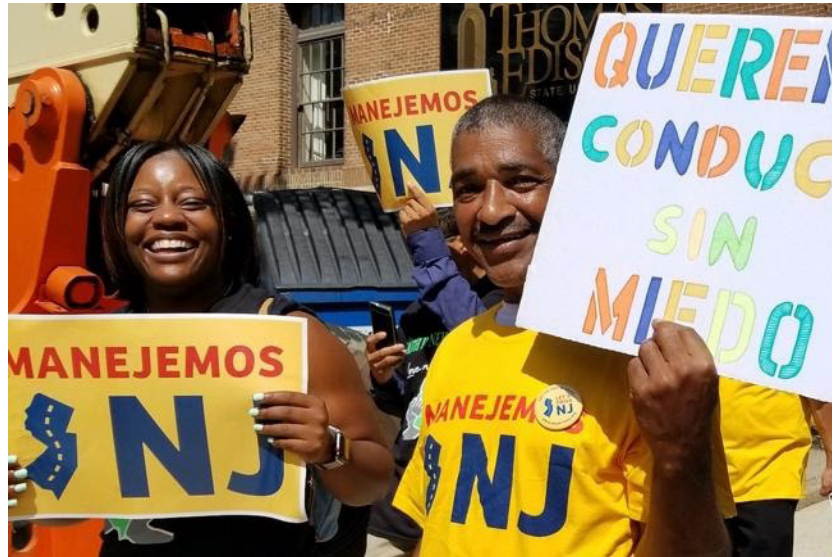
CAC and care team members attend a rally in Trenton, NJ to expand access to driver's licenses in New Jersey.

In 2019, we made a concerted effort to recruit graduates of our Camden Core Model as CAC members, and watched the CAC become a vibrant and inspiring peer community. CAC members joined with partner agencies to advocate for policies that will improve well-being for vulnerable community members, including expanding access to driver's licenses, supportive housing, and trauma-informed alternatives to youth incarceration in New Jersey.