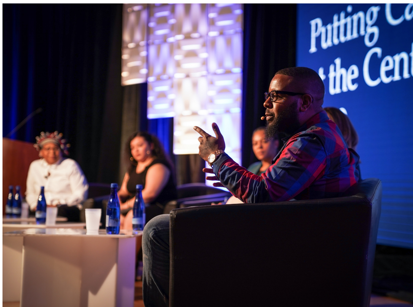
The "Power and accountability in authentic storytelling" plenary at the 2019 conference.