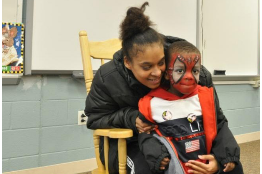
A CAC member, accompanied by her son, shares her story at the Camden Family Festival.

The Camden Family Festival aimed to connect families to health and social services in their community. Over 100 organizations filled the Octavius V. Catto Community School to provide resources to hundreds of Camden residents. Alongside live performances from the famed Camden Sophisticated Sisters Drill Team and more, one of our CAC members shared through tears how her health and social complexities affected her pregnancy.