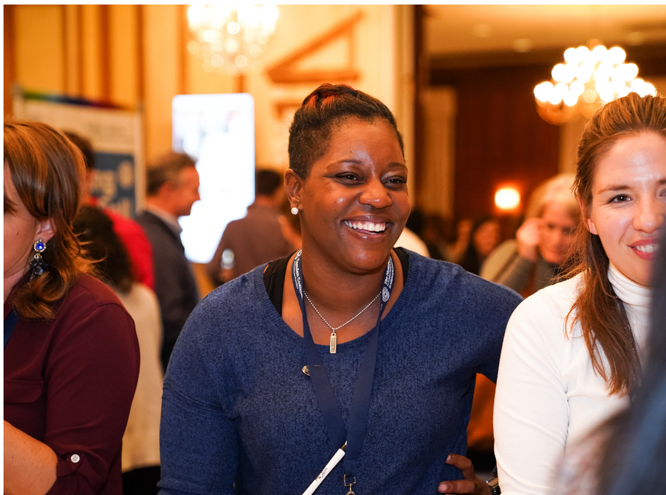
Care team members share our COACH framework at Putting Care at the Center 2019.