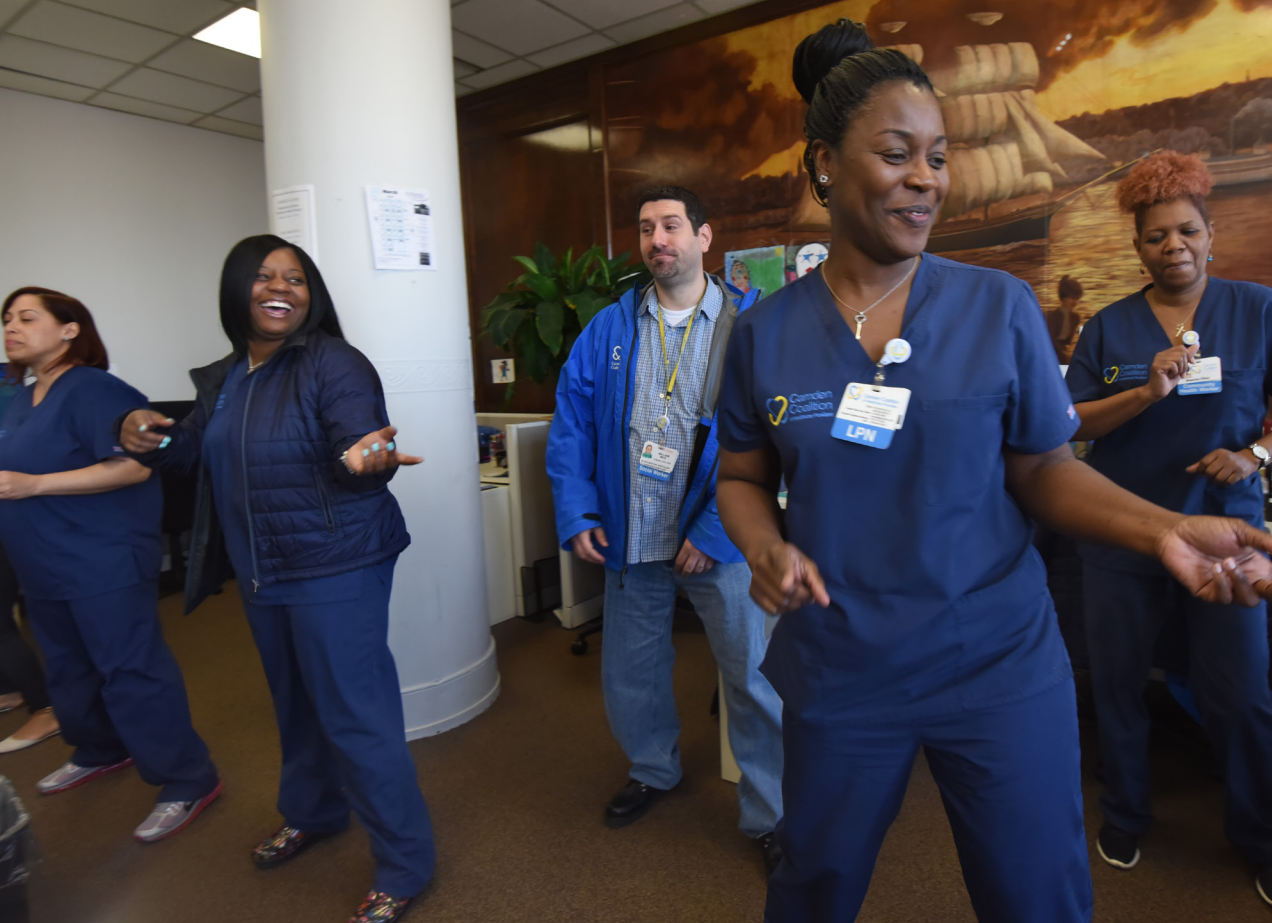
Care team members line dance during a morning huddle.