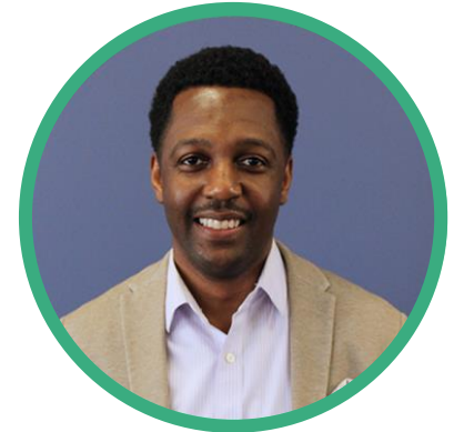
Moderated by: Victor Murray Camden Coalition