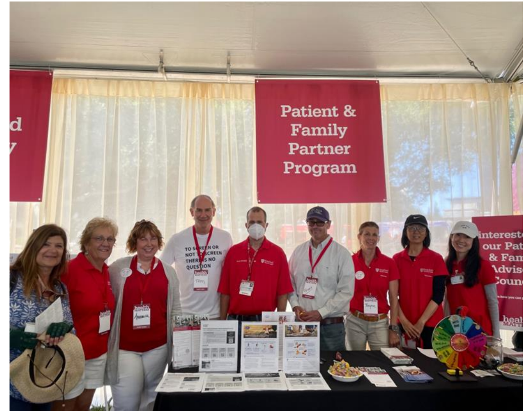
Patient & Family Engagement Opportunities