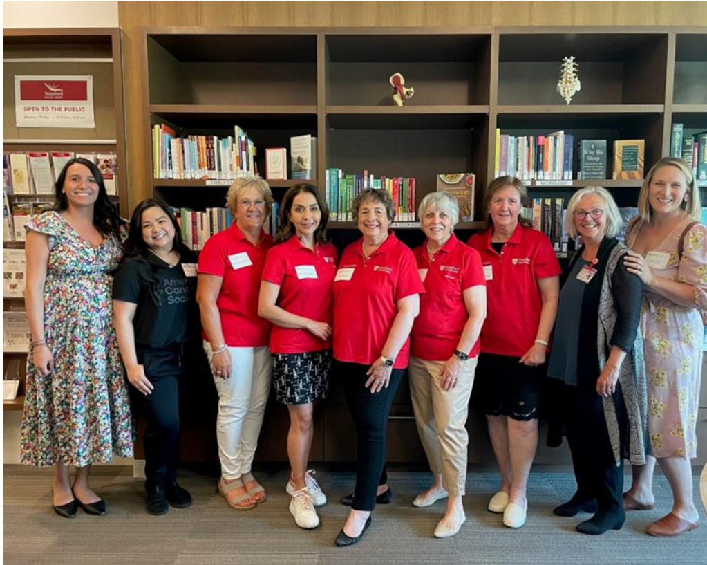
Patient & Family Advisory Councils (PFACs)